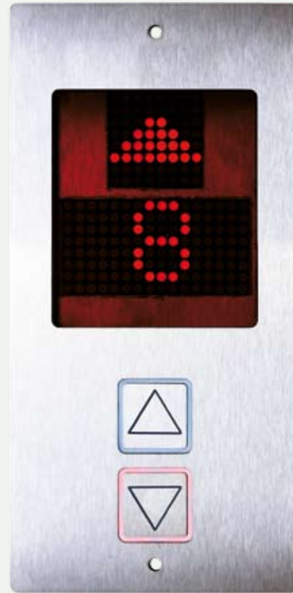
KBI 8x8 / 16x8